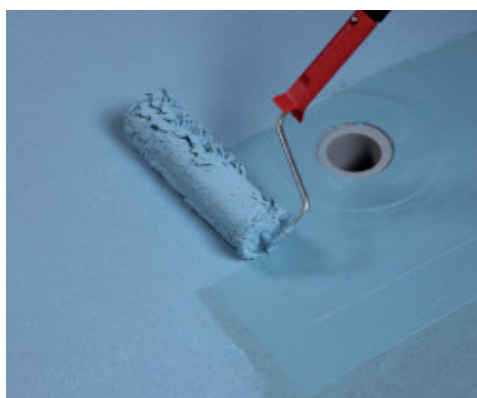
Application by roller of the second coat of Mapelastick AquaDefense Zero