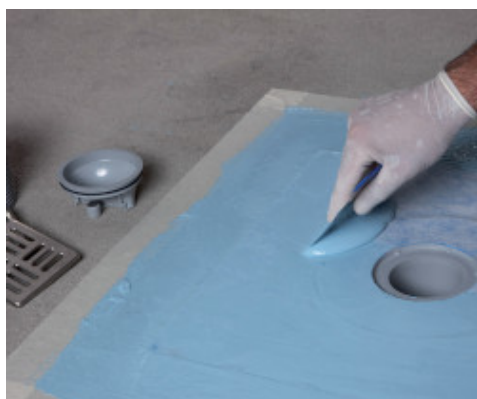
Impregnating Drain Vertical fabric with Mapelastick AquaDefense Zero

Grout tile joints with a special cementitious grout (such as Ultracolor Plus - class CG2WFA, Keracolor FF , Keracolor GG mixed with Fugolastic ) or epoxy grout (for example Kerapoxy , Kerapoxy Easy Design , or Kerapoxy CQ - class RG). Seal expansion joints with a special MAPEI sealant (such as Mapesil AC , Mapesil AC Eco , Mapesil LM , or Mapeflex PU 45 FT , according to requirements).