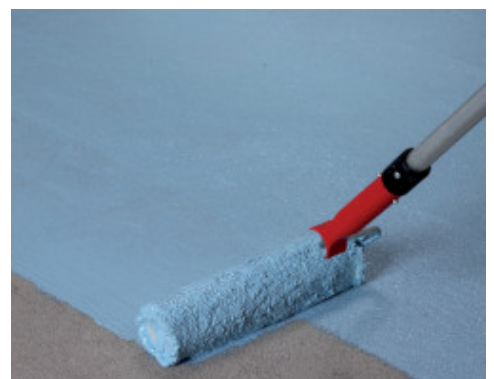
Application of the first coat of Mapelastick AquaDefense Zero on a screed