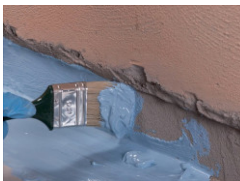
Application of Mapelastick AquaDefense Zero by brush between floor and wall before applying Mapeband