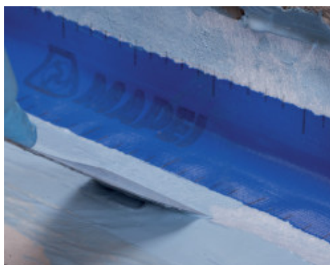
Application of Mapeband on a wall-floor fillet joint with Mapelastick AquaDefense Zero